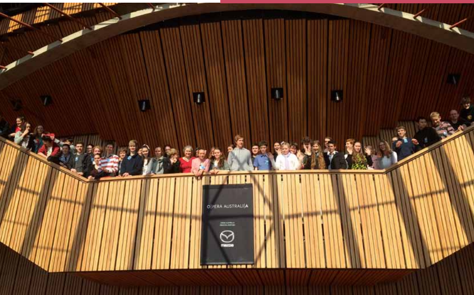
Central Coast Conservatorium students were once again invited to participate in the Australian Opera Ballet Orchestra (AOBO) Project in August 2014