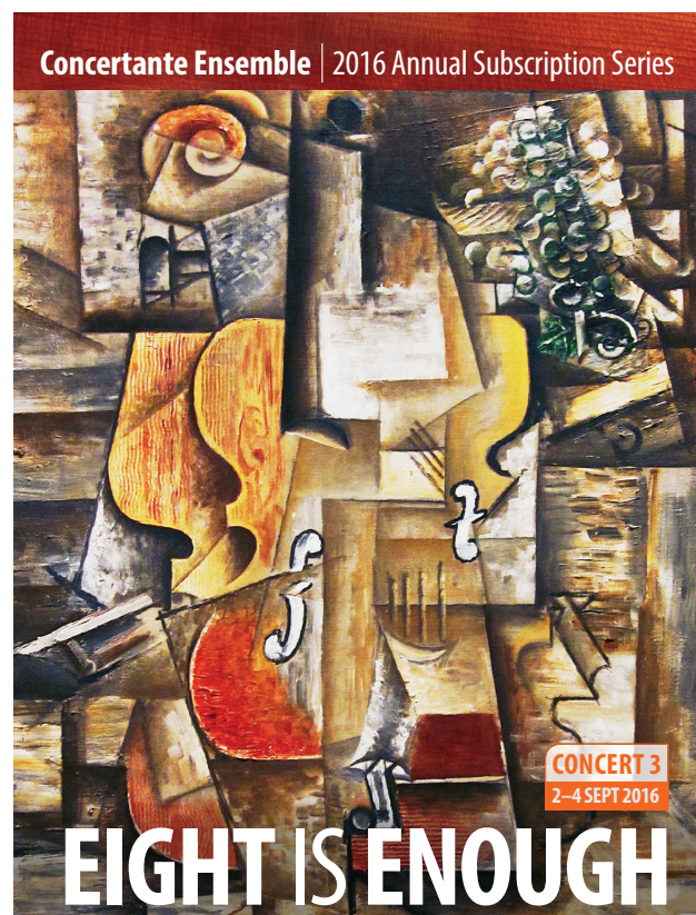
Image: Violin and grapes by Pablo Picasso

into classical world guitar. Tickets: Adults $40, Conc $30. Available online at www.trybooking.com/LYKR