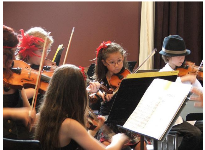
Members of the Junior String Orchestra perform at the end of the String Summer School